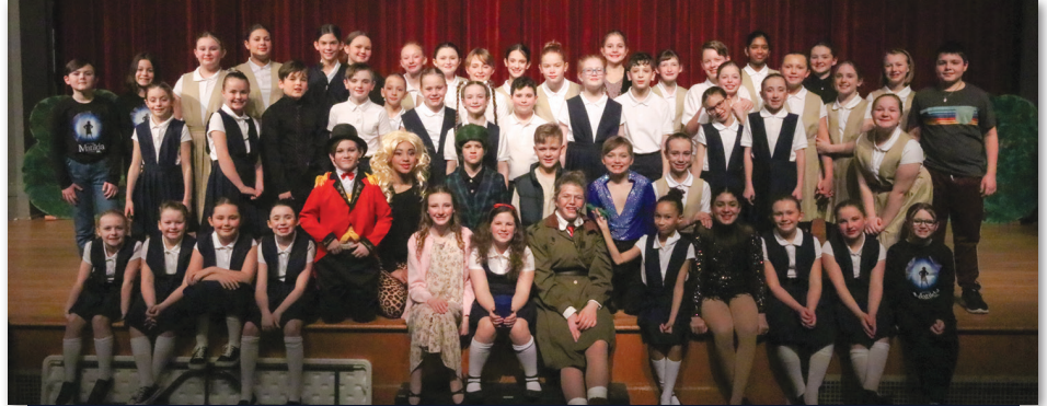
Cast of "Matilda Jr." performs for over 1,000.