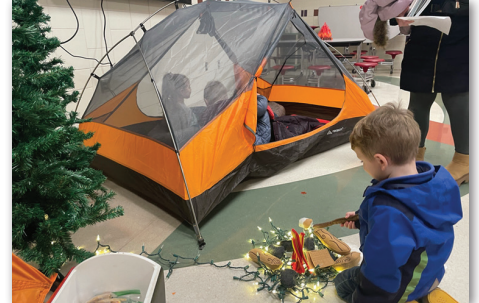
The Hornell PTO Family Camp Out Night at North Hornell brought families together with activities and more.

Our commitment to student success extends to all. We will continue to