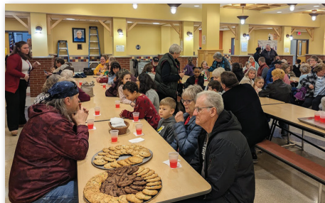
Grandparents, parents, and special individuals celebrate "Grand Week" at Hornell Intermediate School.