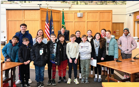
Intermediate School students learning about local government at Hornell City Hall.

* TAX RATE INCREASE IS A PROJECTION BASED ON CURRENT EQUALIZATION RATES AND ASSESSMENTS AVAILABLE AT THIS TIME.